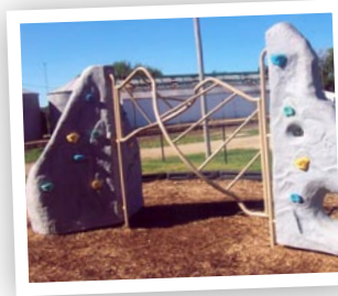
LEFT: A CHIP grant helped complete construction of a new playground in Bennington. RIGHT: A CHIP grant allowed Saline County Sheriff's officers to purchase a simulator to teach the risk of driving under the influence of drugs or alcohol.

A $18,784 grant to the Saline County Sheriff's Department allowed it to purchase a driving cart that simulates the effects of alcohol or drugs on a motorist's driving skills. Officers use the cart for demonstrations at area schools, fairs and youth activities