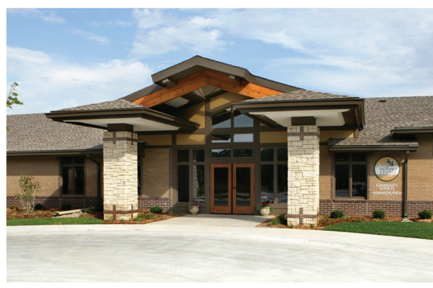
The Kaye Pogue Hospice Center provides state-of-the-art care for those with terminal illness and are no longer able to stay at home.

Contact the Foundation for more information on this gift giving opportunity by calling (785) 452-6088.