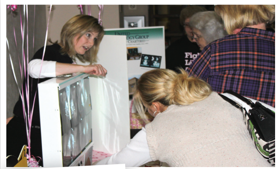
ABOVE: Attendees of the annual Breast Cancer Forum learn how digital mammography can be superior to film studies. LEFT: Participants created entries for the Art Bra Contest after the Avon Army of Women March in downtown Salina.